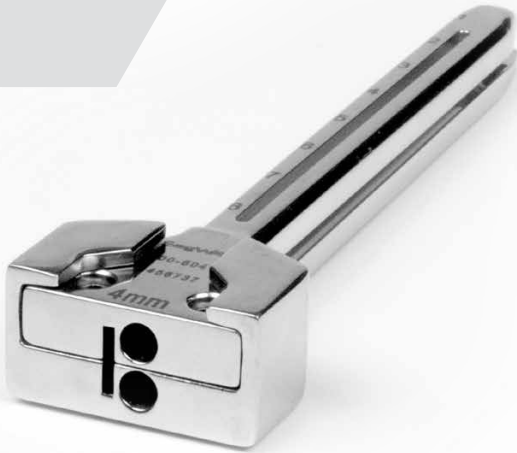
Uniportal dual scope guide system