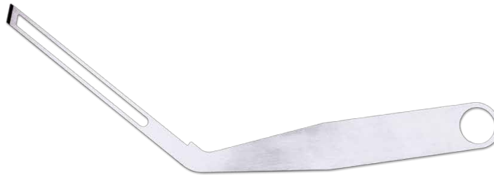
Independent antegrade knife operation with view port