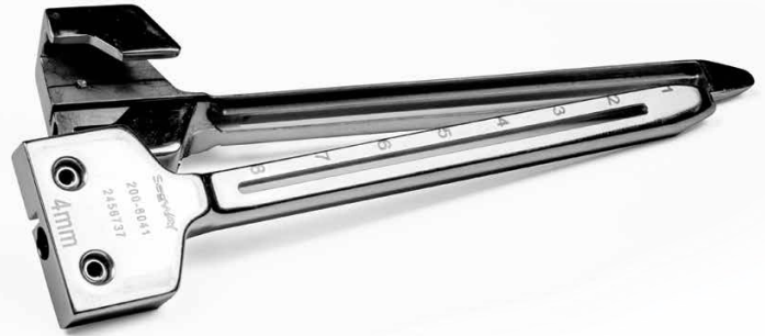
Individual long guide system